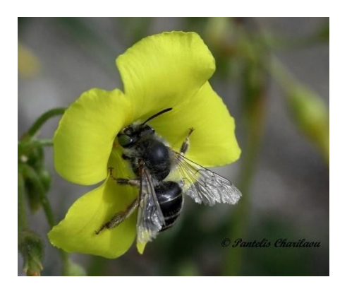
Solitary bee on Oxalis flower

Many wild and cultivated plants depend on insects to pollinate their flowers, with successful pollination leading to successful seed or fruit production. There are concerns that numbers of pollinating insects such as bees and flies may be declining, but we need more data to be able to track changes in abundance across the country. The Flower-Insect Timed Count (FIT Count) was designed by a Research Team in the UK to collect new data on numbers of flowervisiting insects, as part of a wider set of surveys under the <a href="UK Pollinator Monitoring Scheme">UK Pollinator Monitoring Scheme</a> (PoMS). We have modified this to enable us to understand more about the pollinating insects in Cyprus for <a href="Pollinator Monitoring Scheme">Pollinator Monitoring Scheme</a> – Kýpros (PoMS-Ký).