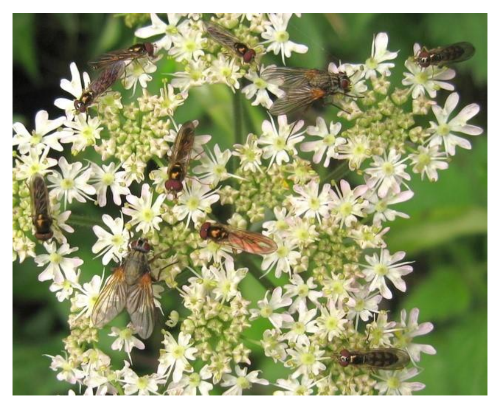
For this Hogweed flower, your tally would be eight hoverflies and two other flies. If one or more of these subsequently visited another flower within your target patch, it should not be counted a second time, but if a 'new' insect landed on the flower it would be counted.